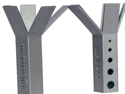
High Resolution 30 µm