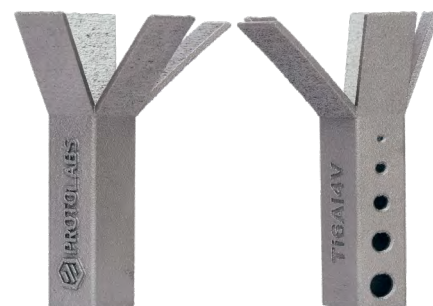
Normal Resolution 60 µm